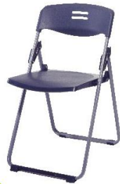
F2 Folding Chair (Gray) 折椅 (灰)