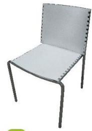
F5 Vogue Chair (White) 時尚椅 (白)