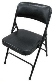
F1 Folding Chair (Black) 折椅 (黑)