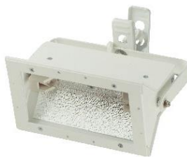
E5 300W Spotlight 300W 投光燈