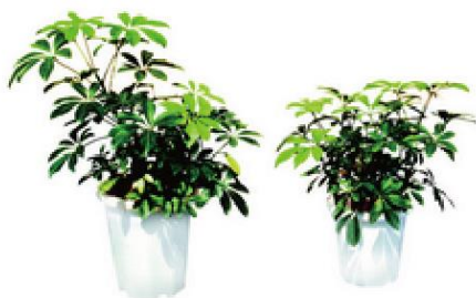
P1 Plants (Medium / Small) 盆栽 (中 / 小)