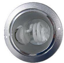
E4 18W Downlight 18W 嵌燈