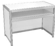
F22 Information Counter (100×50×75cmH) 服務台