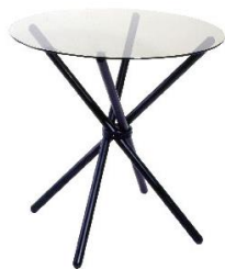
F11 Glass Round Table 75Φ × 75cmH 玻璃圓桌