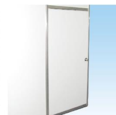
F39 Lockable Door (100×250cmH) 可鎖木門