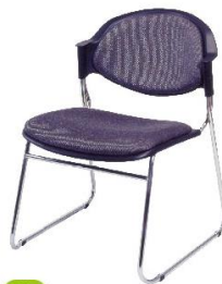
F3 Arm Chair-Fabric Cushion 布質扶手椅