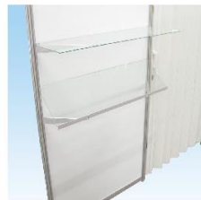
F32 Glass Shelf (Flat/Slope) (100×30cm) 玻璃層板 (平 / 斜)