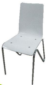
F6 Acrylic Chair (White) 壓克力椅 (白)