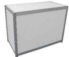
F24 Display Cube (100×50×75cmH) 長方形展示台