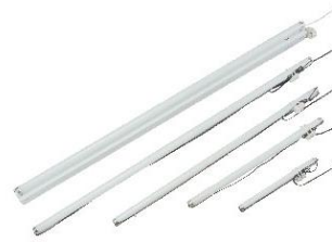
E3 Fluorescent Tube 日光燈管