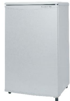
E8 Refrigerator (Small) 47×49×74cmH (80liter) 冰箱 (小)