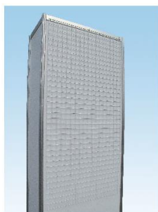
F35 Grid/Wire Mesh (Small) (90×90cmH) 小鐵網