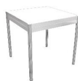
F21 Square Table (70×70×75cmH) 方桌