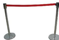
F17 Barricade 圍欄