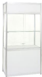
F30 Tall Glass Showcase (100×50×200cmH) 玻璃高櫃