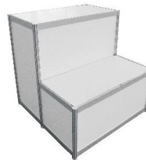
F28 Two-tier Display Counter (100×50×50 / 100cmH) 階梯形展示台