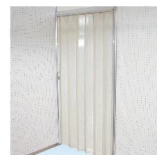
F38 Folding Door (100×250cmH) 折門