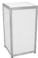
F25 Square Display Cube (50×50×75cmH) 方形展示台