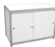
F23 Lockable Cupboard (100×50×75cmH) 可鎖櫃