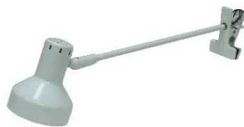
E2 18W Long Arm Spotlight 18W 長柄投光燈