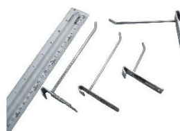
F37 Hook for grid/wire mesh (5cm/10cm/15cm) 掛勾