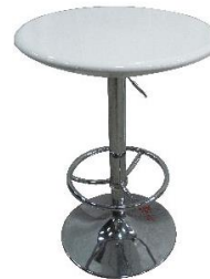
F14 Air Lift Bar Table 60Φ × 90cmH 氣壓式吧桌 (白)