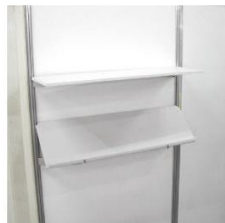
F31 Wooden Shelf (Flat/Slope) (100×30cm) 層板 (平 / 斜)