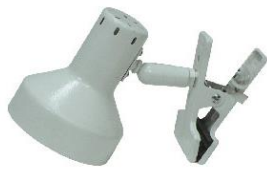
E1 18W Spotlight 18W 投光燈