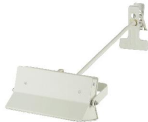
E6 300W Long Arm Spotlight 300W 長柄投光燈