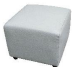
F15 Sofa (Square) 45W × 45L × 40cmH 方型沙發