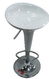
F10 Air Lift Bar Stool 氣壓式吧椅 (白)