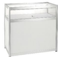
F29 Low Glass Showcase (100×50×100cmH) 玻璃矮櫃