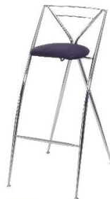
F8 Silver Bar Stool 創意吧椅