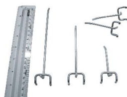
F36 Hook for pegboard (5cm/10cm/15cm) 掛勾