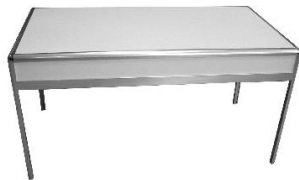
F20 Rectangular Table (150×74×75cmH) 會議長桌