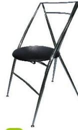
F4 Silver Chair 銀色洽談椅