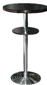
F13 Bar Table 60Φ × 103cmH 雙層吧桌