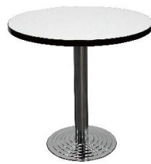
F12 Round Table 75Φ × 75cmH 會議圓桌 (白)