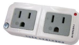
E7 Power Socket 插座