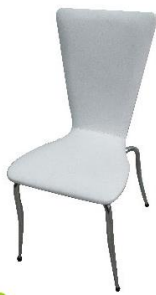
F7 Island Chair (White / Black) 捷思椅 (白 / 黑)